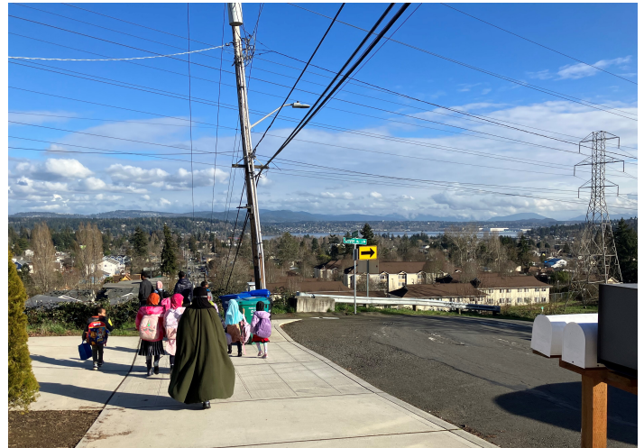
Wing Luke Elementary students walking on S Kenyon St

Learn more and sign up for email updates at: seattle.gov/transportation/KenyonWaySidewalk